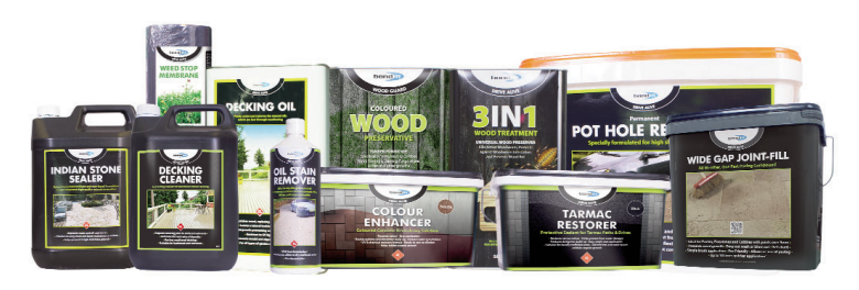
Part of the Bond It Drive Alive Range

The data presented in this leaflet are in accordance with the present state of our knowledge, but do not absolve the user from carefully checking all supplies immediately on receipt. We reserve the right to alter product constants within the scope of technical progress or new developments. The recommendations made in this leaflet should be checked by preliminary trials because of conditions during processing over which we have no control, especially where other companies raw materials are also being used. The recommendations do not absolve the user from the obligation of investigating the possibility of infringement of third parties rights and, if necessary clarifying the position. Recommendations for use do